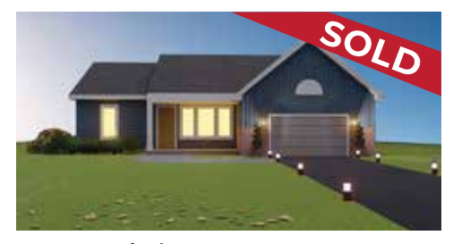
259 Winburn Ave. - Lot 43