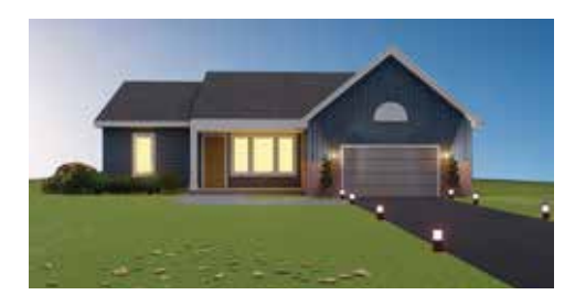
256 Winburn Ave. - Lot 48