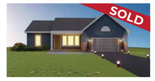
251 Winburn Ave. - Lot 42