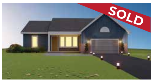
227 Winburn Ave. - Lot 39