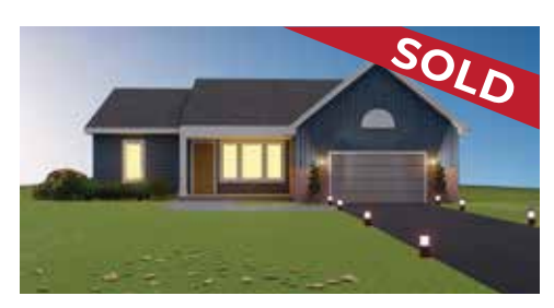
219 Winburn Ave. - Lot 38