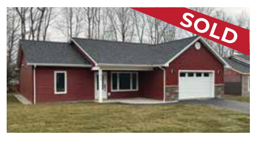
235 Winburn Ave. - Lot 40